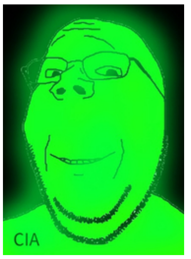
>>10523 (You) I really am to retarded Im not CIA Fuck off Your probably datamining me

File (hide): 1626514254257.jpeg (187 KB, 428x593, Drawing.sketchpad (3).jpeg)