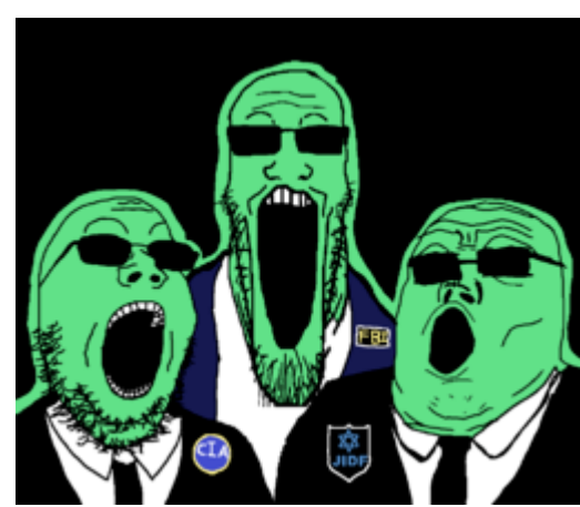
>WE CAN'T OPEN EXE FILES THEREFORE WE CAN'T DATAMINE YOU CHHD >TRUST THE SCIENCE

File (hide): 1626513348678.png (59.18 KB, 968x832, 1626350030452-2.png)