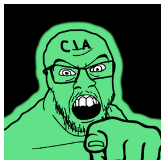
>I HAVE A MADE UP MENTAL ILLNESS THEREFORE I'M UNABLE TO DATAMINE